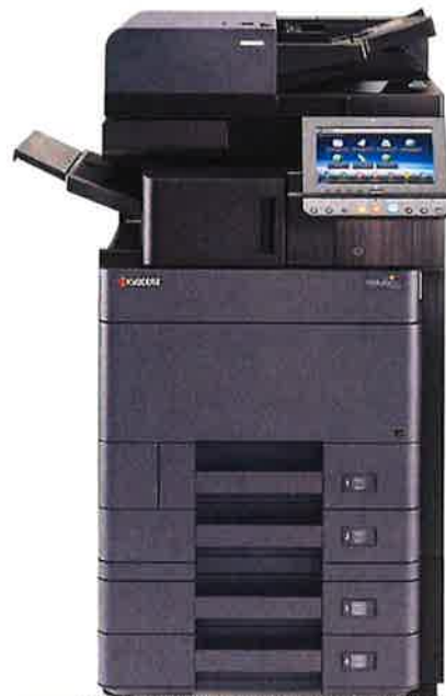
Shown with a Dual 500 Paper Trays and Internal Finisher

60 Month: $ 98.30/mo. + Tax (If applicable)